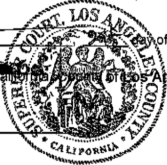
(Printed Name of Magistrate)

Judge of the Superior Court of California, County of Los Angeles, Central Civil West, Dept. 121